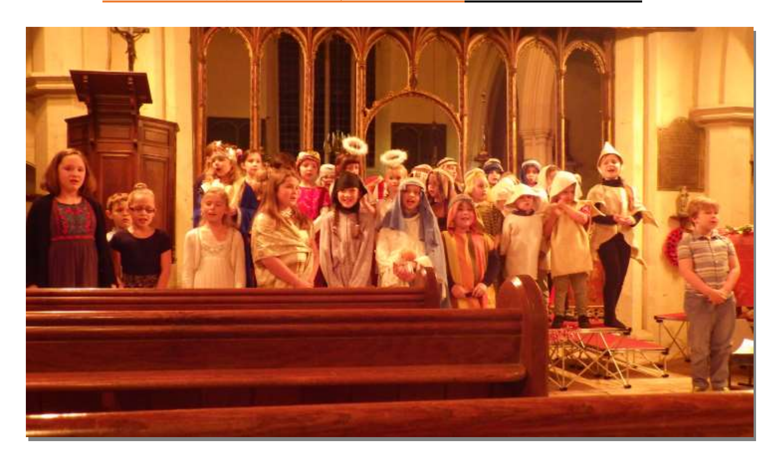
Fun singing with the Wherry Academy Brass Band