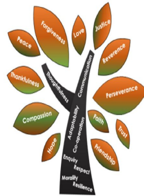
Democracy Law Liberty respect Tolerance Our Values Tree 'A tree is known by its fruit' Matthew 12.33