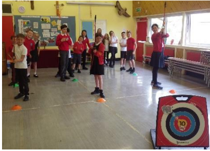
Archery with Premier Sports