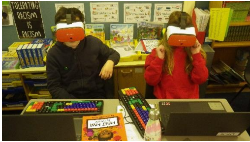
Story writing with VR Headsets